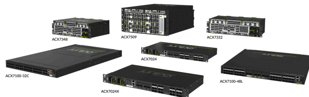
Figure 1. Juniper Networks ACX7000 family—engineered for the IP service fabric of a Juniper Cloud Metro

The ACX7000 family of routers, purposely built for the IP service fabric underlay of a Juniper Cloud Metro , leverages the industry's fastest chipset, provides a unique balance of system design, and sets new benchmarks for sustainable, high-performance platforms. Managed by Junos® OS Evolved and Juniper Paragon™ Automation , ACX7000 routers are embedded with Paragon Active Assurance and with Zero Trust security built in, enabling operators to deliver highly differentiated customer experiences. Available in environmentally rated, fixed, fixed plus modular, and fully modular designs, these energy and footprint efficient multiservice routers support high precision timing technologies and are engineered for service provider, enterprise, residential (including passive optical network (PON) with the Juniper Unified PON Solution ), IoT, and 4G/5G mobile applications.